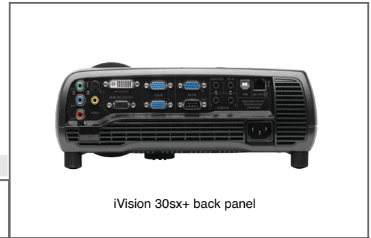
iVision 30sx+ back panel

Projector dimensions (mm) L1 244 W1 278 H1 88