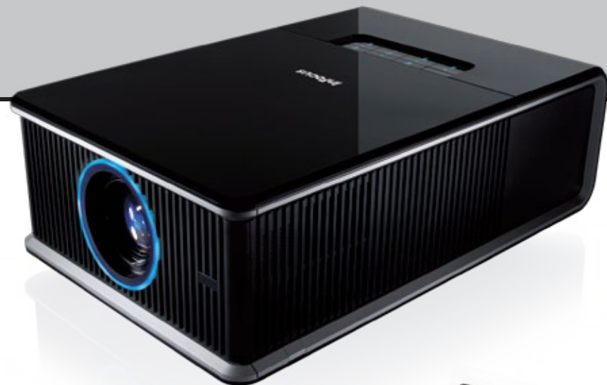
Optional Skin Glass Black

Offering best-in-class performance and a wealth of features, the IN5500 series projectors use DLP® DarkChip™ technology and InFocus award-winning BrilliantColor™ implementation, and offer up to WUXGA (1920 × 1200) resolution. These projectors are ideal for demanding professional applications requiring flexible lens options. With rich connectivity and embedded networking, the IN5500 series also features a filter-free design for fail-safe 24/7 operation. Customizable skins and an integrated cable management give the IN5500 series a sleek, elegant profile to complement any venue. And with a high brightness of up to 7000 lumens, any audience will sit up and take notice.