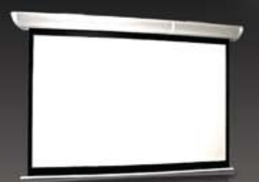
100" electric screen with integrated LCR speakers