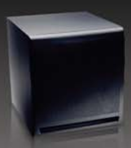
10" subwoofer with 5.1 channels of amplification