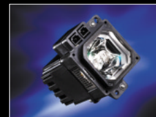
User-replaceable Lamp BHL5010-S