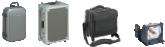
VT60ROLLER VT60ATAPRO TRAVELPRO200 LAMP