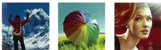
High color brightness and high white brightness