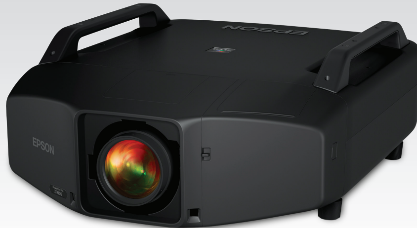
Projector shown with lens. Lens sold separately.