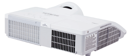
Back 3/4 View